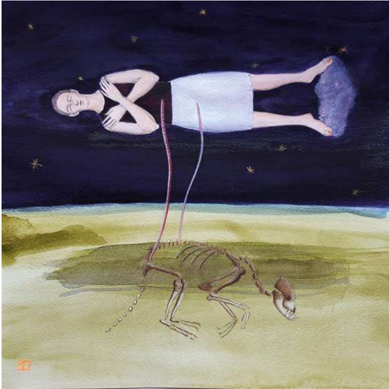
Dreaming Woman with a Dog tempera on paper, 30x30cm, 2019